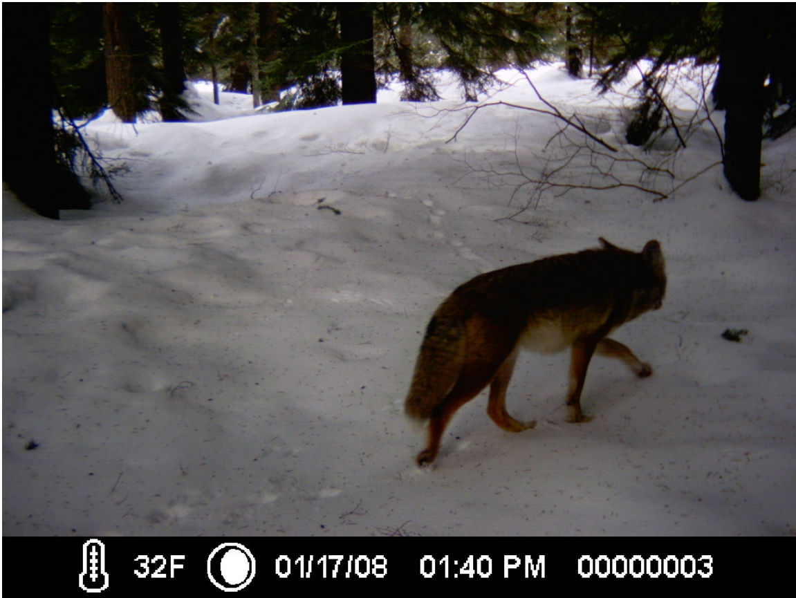
photo 1. Canis latrans . Price-Noble West Transect (north side of Interstate)